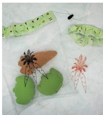
PRODUCE BAGS —simple designs on mesh and you have a reusable produce bag