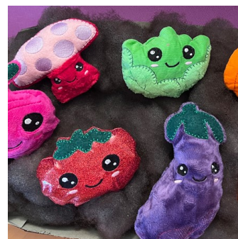
MINI PLUSHIES —fun to make and perfect for play