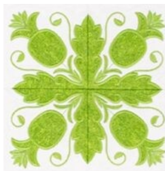
TILED QUILT —Hawaiian inspired tile mini quilt