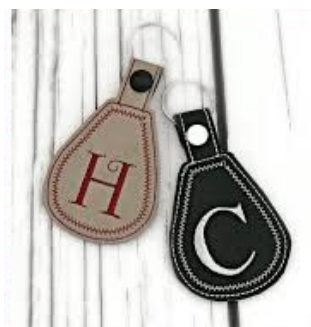
MONOGRAMMED KEY FOB — leather key box with custom monogram, allows you to combine designs to create great gifts