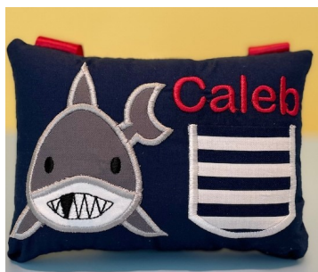
TOOTH PILLOW — Lettering and design combinations with in-the-hoop construction

CALL: 508-481-2088 -or- EMAIL: info@waysidesewing.com