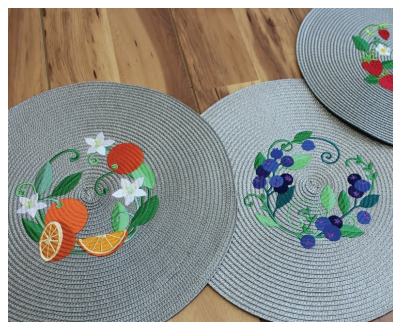
WORKING WITH WICKER — decorated placemats for any table