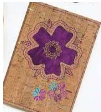
REVERSE APPLIQUE — Cork notebook cover with reverse applique