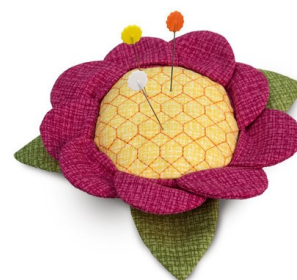
FLOWER PINCUSHION —use multiple hooping's to create a pincushion