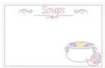
RECIPE CARDS —working on cardstock with simple designs