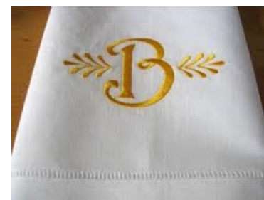
TOWEL TIME —see how dry cover makes amazing towel designs