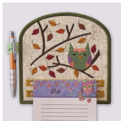
NOTE HOLDER —magnetic notepad holder you customize with the looks you want